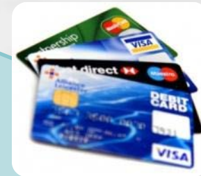
Payment system / e-Purse