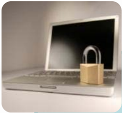
Network Access Control