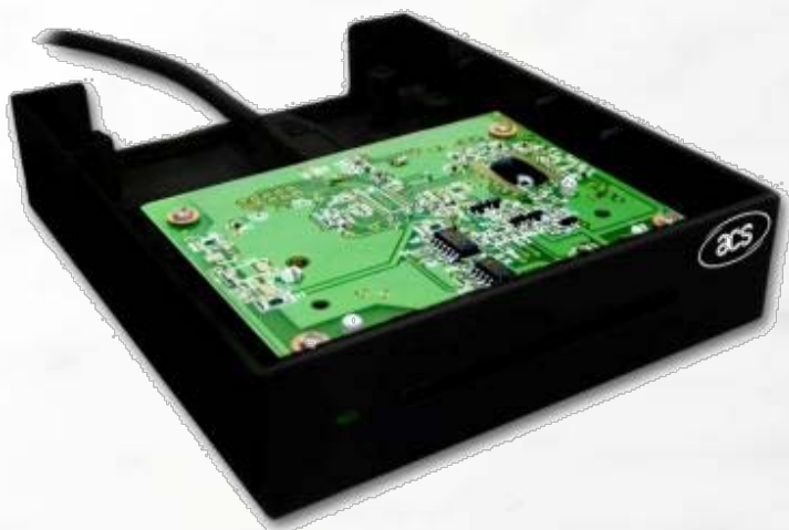
ACR38F Smart Floppy

The ACR38F Smart Floppy is the ideal solution for easy integration of a smart card reader into the desktop environment.